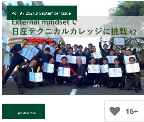
TEAM's E! External Nissan technical with mindset Challenge to college part 2