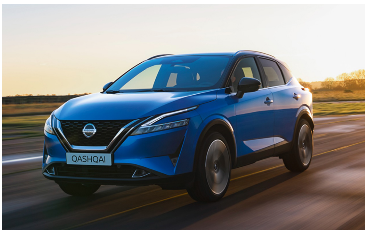
Nissan Qashqai with Jatco CVT-X

Report on the current reputation of the vehicle.