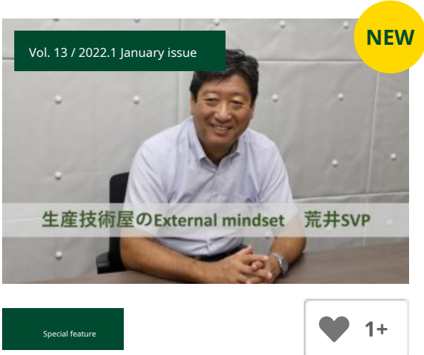
External mindset soot Arai SVP: Production engineer External mindset