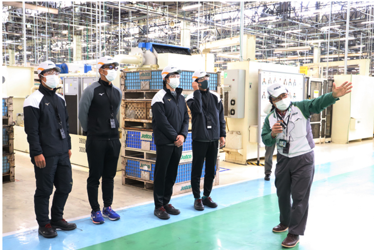
Levante players touring the CVT production line at 2 factories in Fuji 1 district

Jatco's sponsorship contract with the professional cycling team "Levante Fuji Shizuoka" Everyone from "Oka" came to visit the factory. Athletes and manufacturing are completely different Although it is an industry, players are curious from the beginning to the end. Deepening mutual understanding, The win-win relationship is likely to deepen.