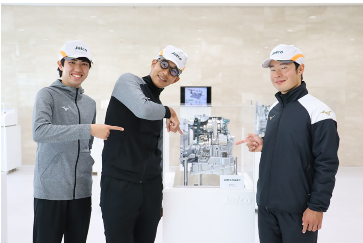
Levante player taking a commemorative photo with Jatco CVT-S in the lobby of Fuji A district

You can watch a video of the factory tour of Levante players.