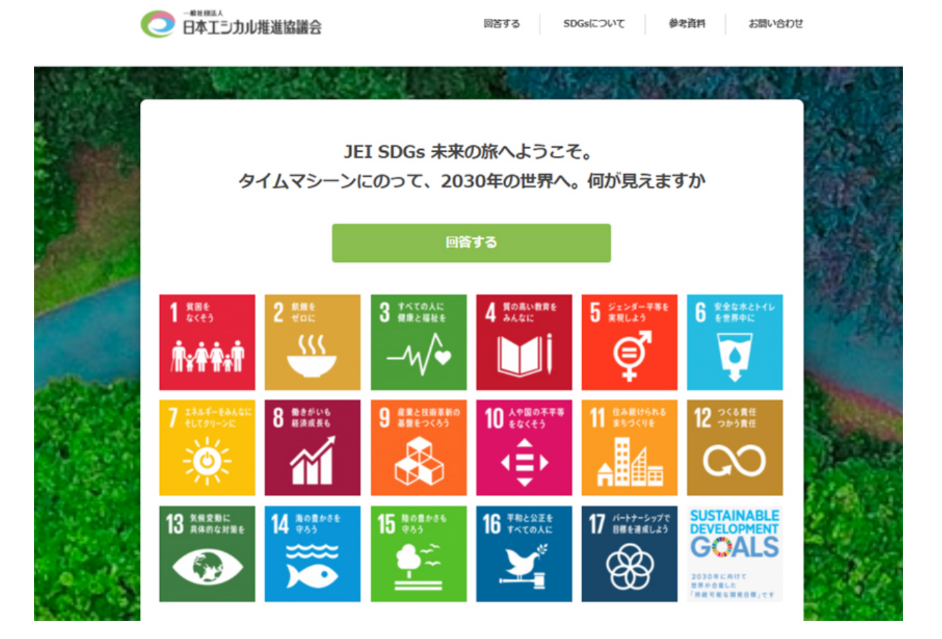
htt p// sd gs2030. jp//