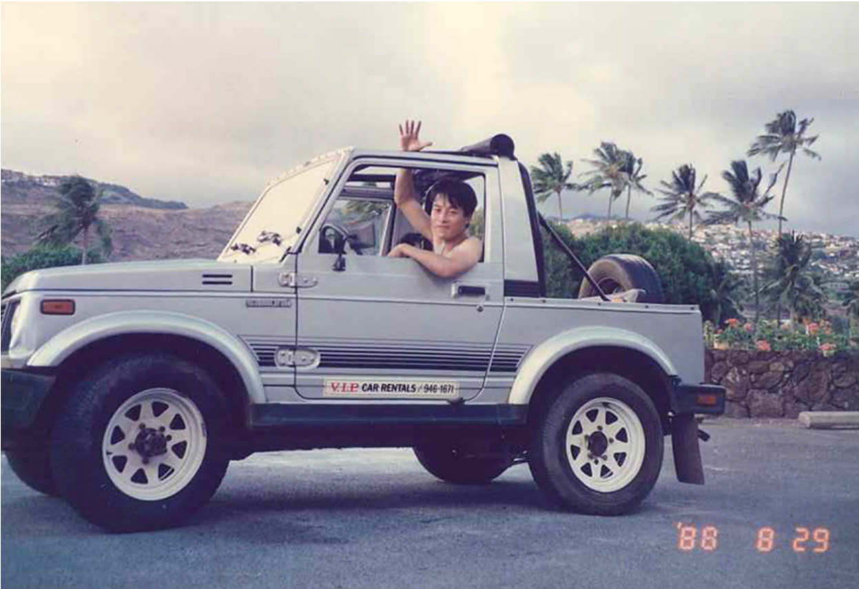
Hawaii traveled with the money saved by part-time work. With Jimny of the rental car (23 years old, when I was a student)