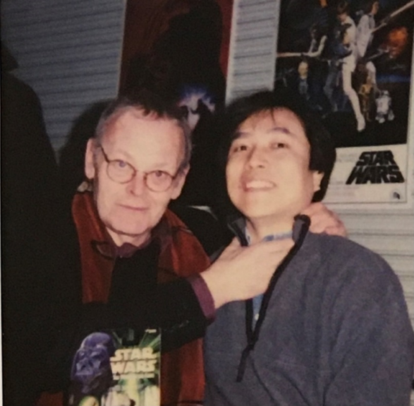
Strangled by Admiral Motti of Star Wars Takemoto-san (2001)