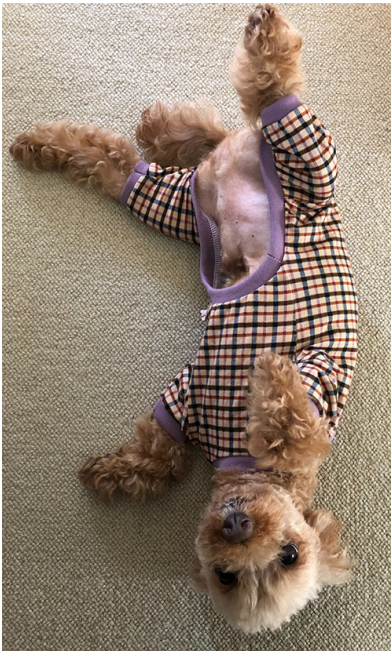
The third son of my dog