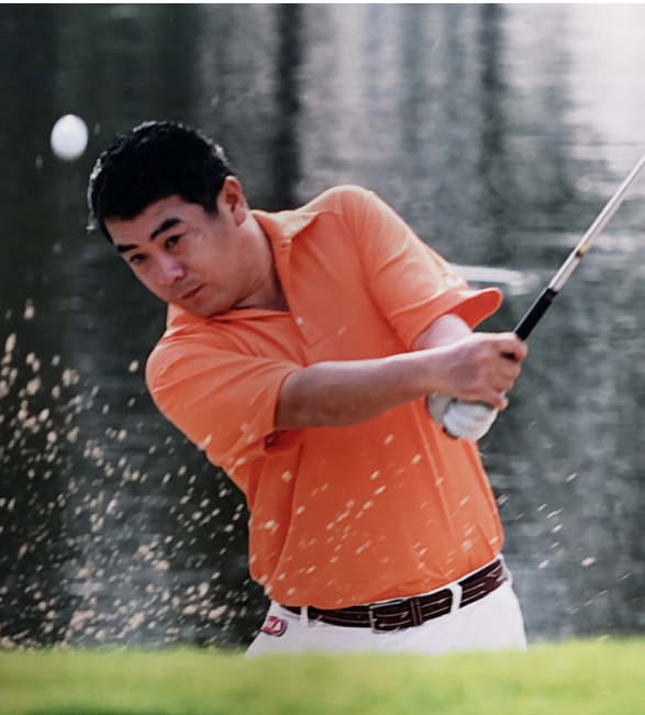
Golf as a hobby. Nice recovery shot!