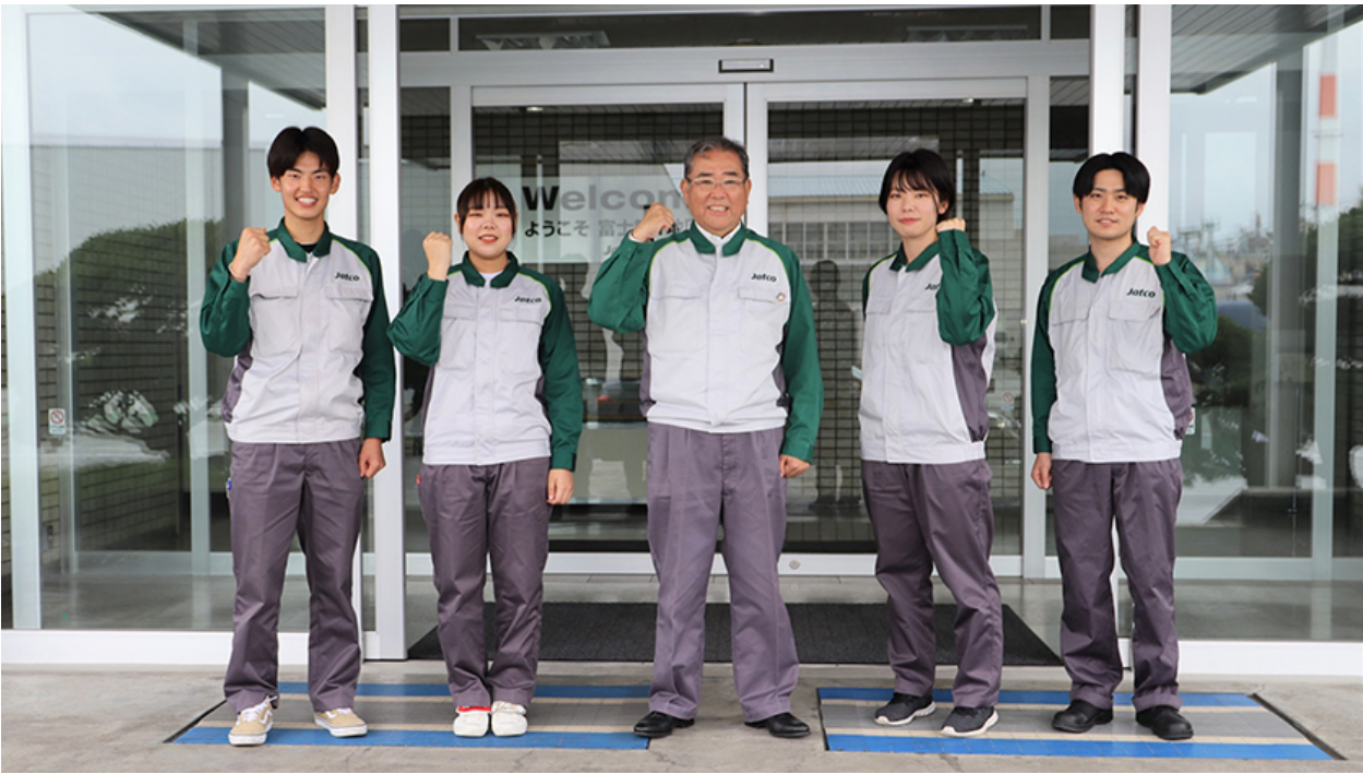
Commemorative photo immediately after the end of the discussion All the new employees who have completed their important roles are all smiles!