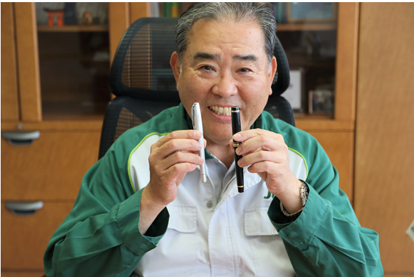
30 years of experience with fountain pens. It's hardcore!