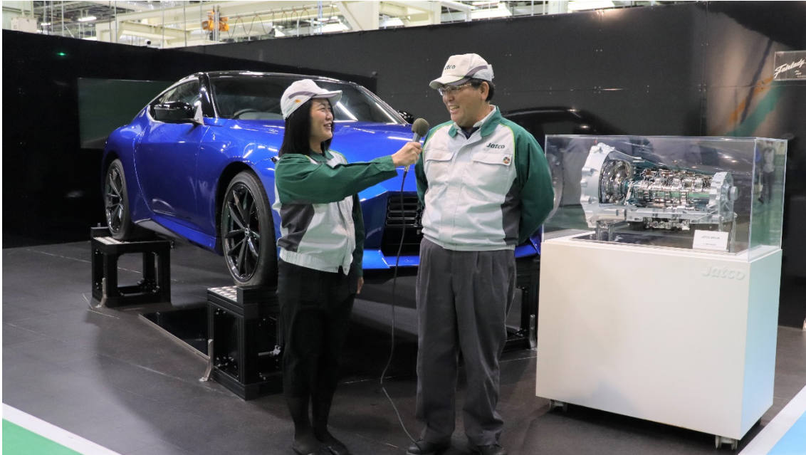
Taken at Fuji a district 9 factory "Fairlady Z" exhibition area

Mt. Fuji 🌄! Mt. Fuji seen from the president's office looks very different. Mt. Fuji is the most unusual scenery since I became president (laughs). Becoming president, I can see outside of the company more compared to my previous position. The movements of industry, suppliers, and economic organizations are much clearer. On the other hand, what makes me little sad is that it becomes harder to see what's going on inside. But I understand that is the nature of president position, and leave the invisible parts to you.