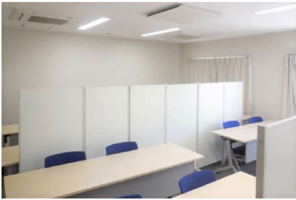
Improvement example 2: Multi-purpose hall You can concentrate!