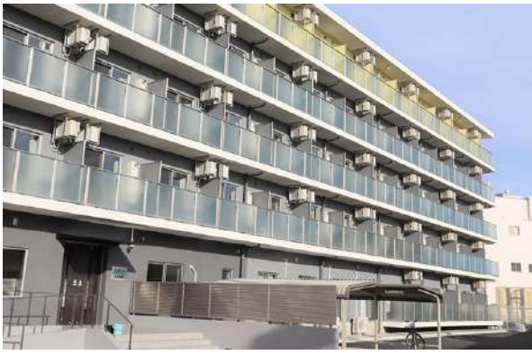
Exterior view of Left Fuji dormitory