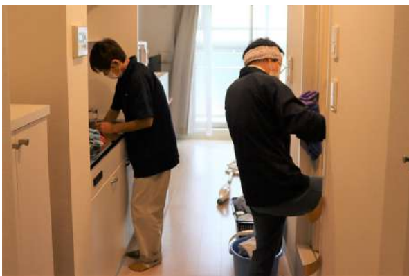
State of cleaning: We are cleaning with all our heart!

The temporary accommodation room will be cleaned when the person leaves. room dirty by people In addition to changing sheets and drying futons, especially in the bathroom We focus on cleaning around the water.