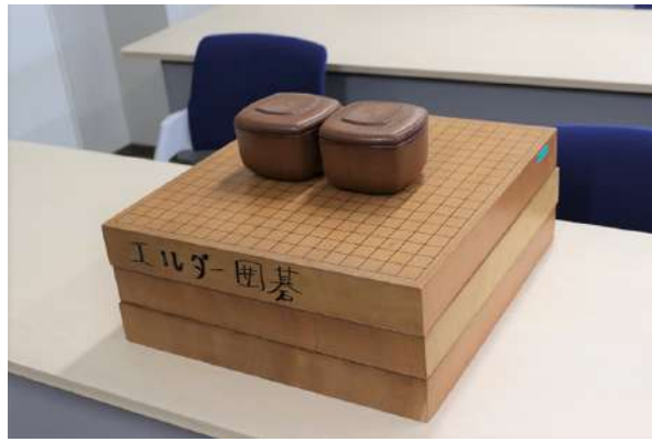
Company OB can also use it for Go

Q. One and a half years have passed since the dormitory opened, but the facilities and rooms in the dormitory are still kept clean. Please tell me what he does to keep it clean.