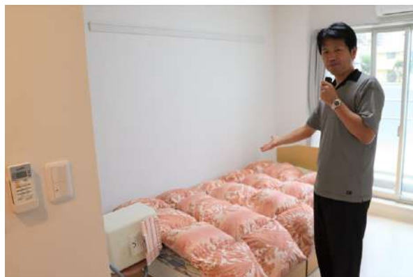
We also dry futons!