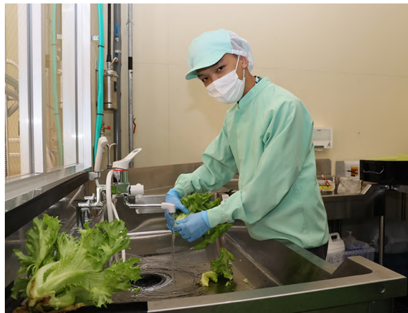
We carefully wash the lettuce to be shipped.

Shizuoka Prefectural Tournament Champion, owner of skill