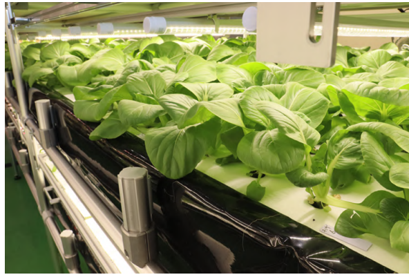
Cultivation room of JGF 2nd factory