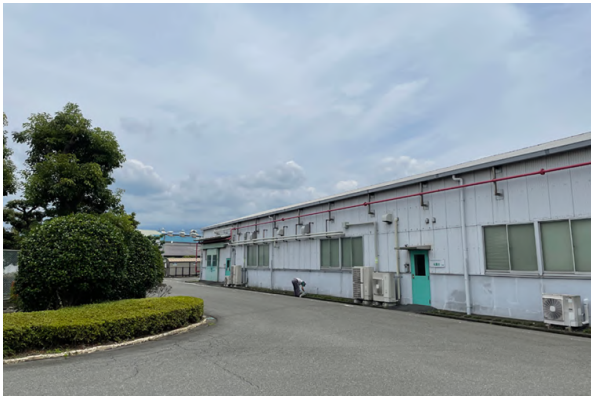
Appearance of JGF