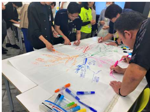
Musashi Innovation Program (2)