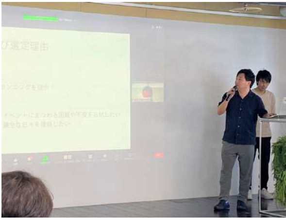
A scene from a presentation in the lab