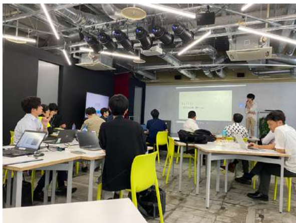
Musashi Innovation Program (1)

From the pioneers, we get the courage to take steps to change ourselves.