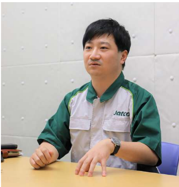
looking back on those days

I want to learn what I don't have. I decided to apply, saying, "Now is the time."