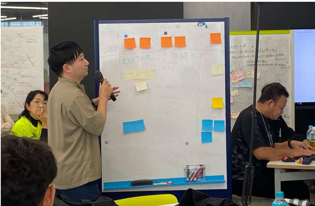
Explore customer insights

I think it's a very important skill to survive.