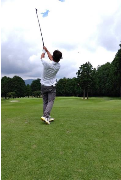
Fig4. Nice shot!