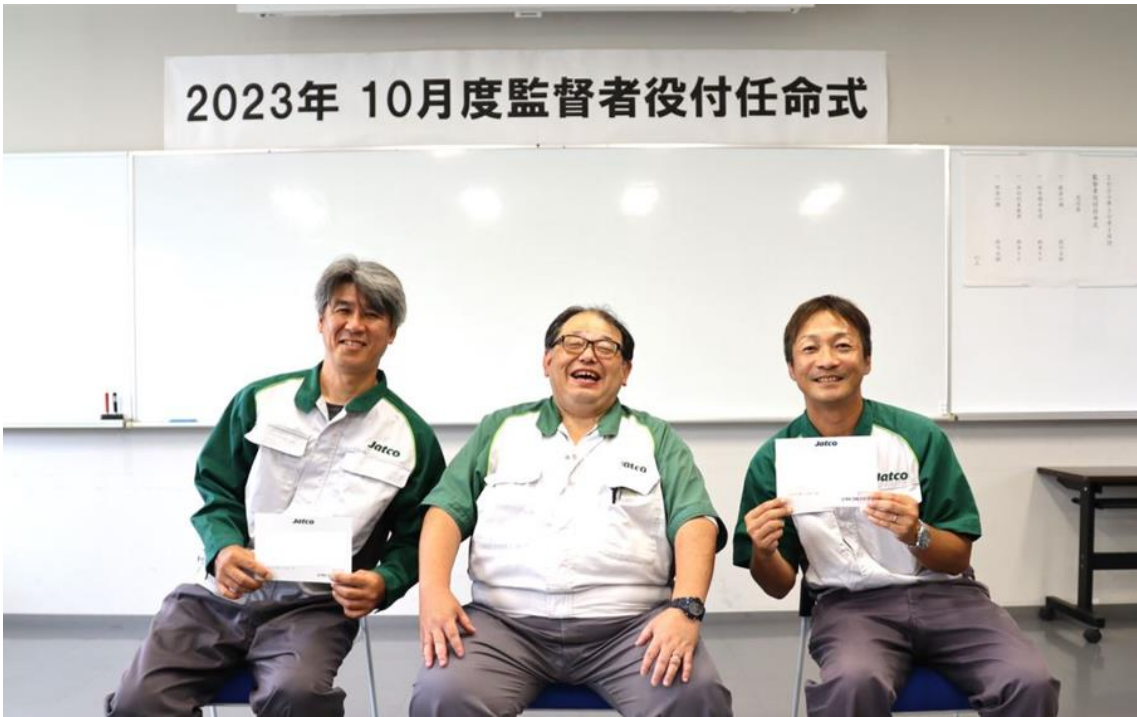
Fig7. Congratulations again on your promotion!