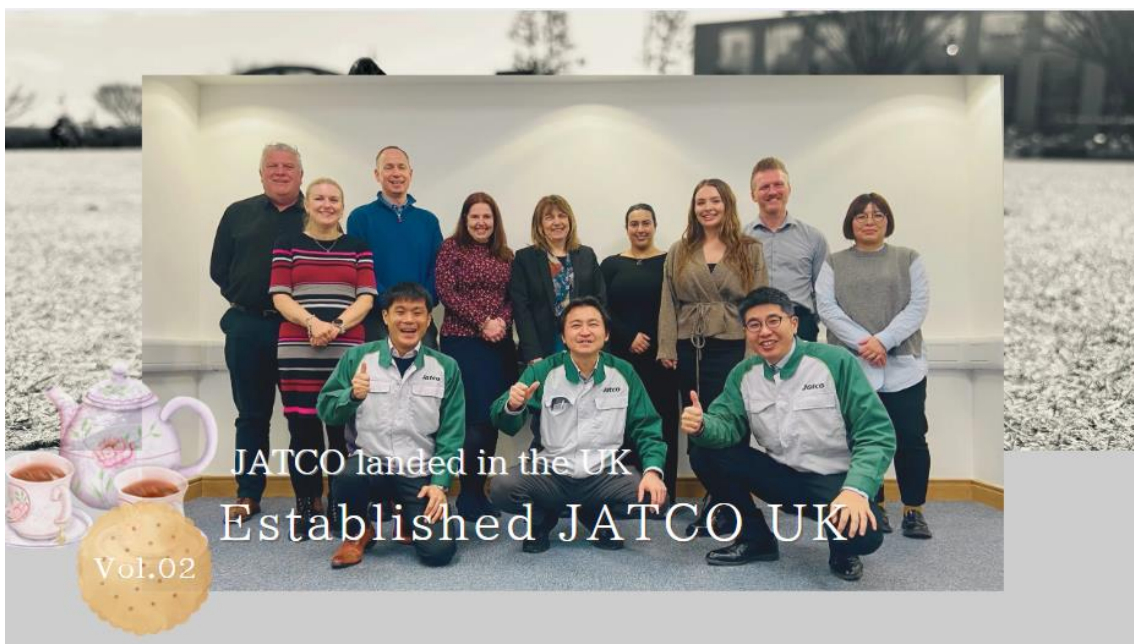
Group photo of all participants

This time we'll introduce our local members, talk about the UK, and look to the future.