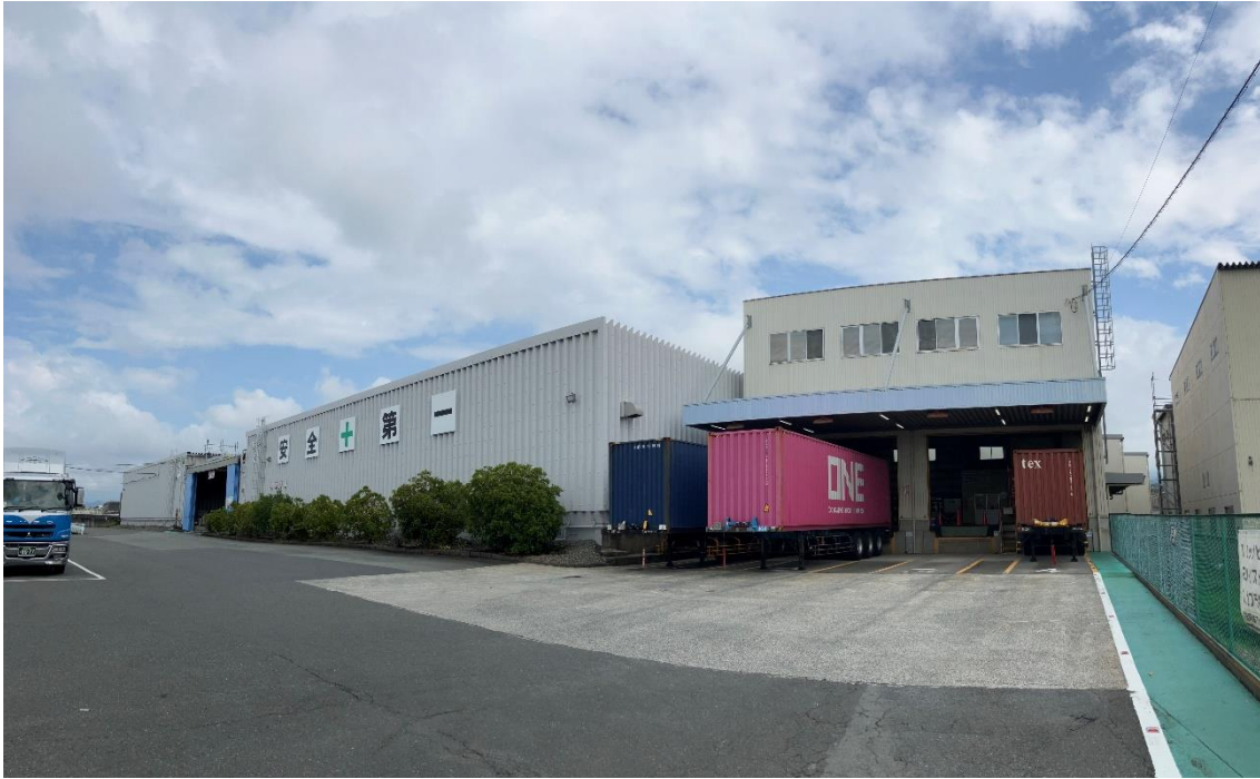
Suzuyo Co., Ltd.'s Hina Logistics Center