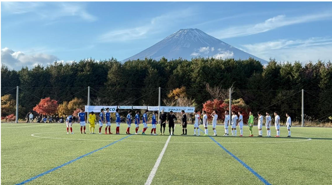
Caption: JATCO Cup 2025 held in a stunning location.

During the tournament, someone's passion becomes someone else's strength, creating a feeling of "I want to come back." It was a special time filled with warmth.