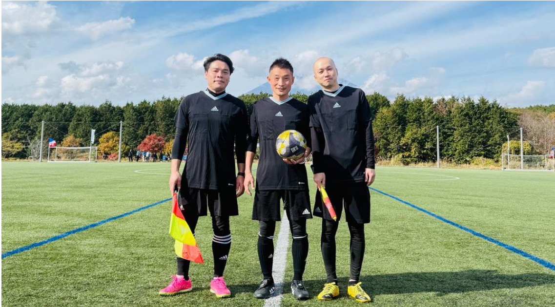
Caption: Referee team formed by F. Marinos × JATCO is perfectly in sync.