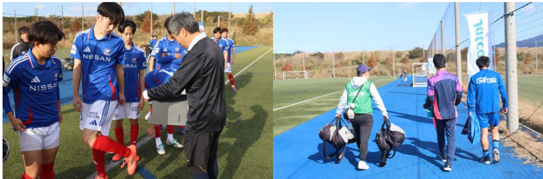
Pre-match team huddle

Even executives are equal on the field of social contribution. Meeting people you wouldn't normally interact with is a unique joy.